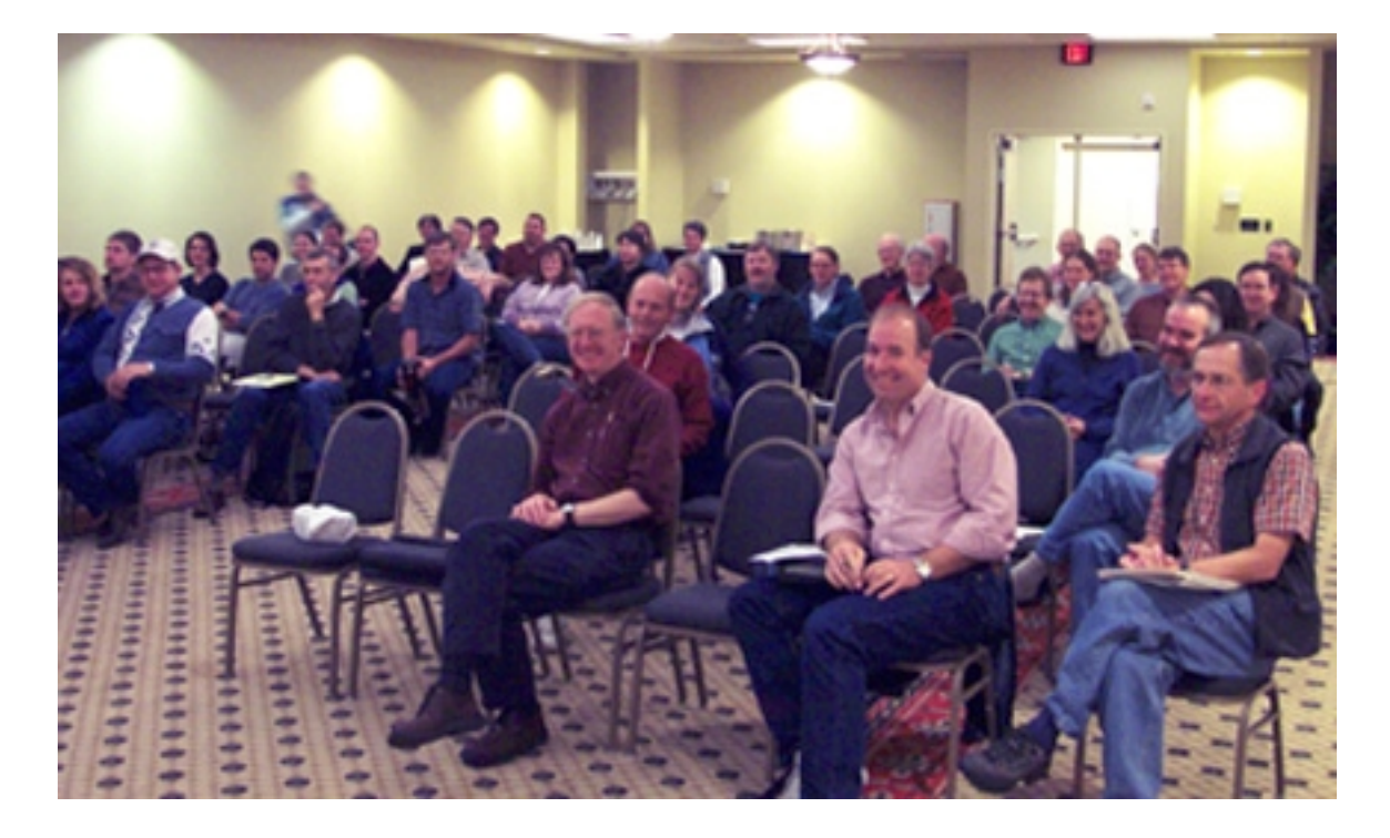
Only those who didn't come weren't having a good time!