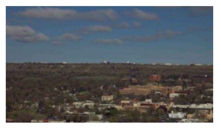
View from the Skytop in Billings, MT Site of the 2004 Intermountain GIS Conference

We would also like to start collecting a library of photos that can be used to enhance newsletter articles and web pages. Pictures of GIS professionals at work or at play in our beautiful Montana scenery will be welcomed.